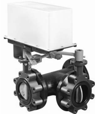
M9000 Series Electrically Actuated, Standard-Pressure, Standard-Temperature, Three-Way Butterfly Valves (with Weather Shield)

If the VF Series Butterfly Valve fails to operate within its specifications, refer to the VF Series Standard-Pressure, Standard-Temperature Butterfly Valves Product Bulletin (LIT-977205P) for a list of repair parts available.